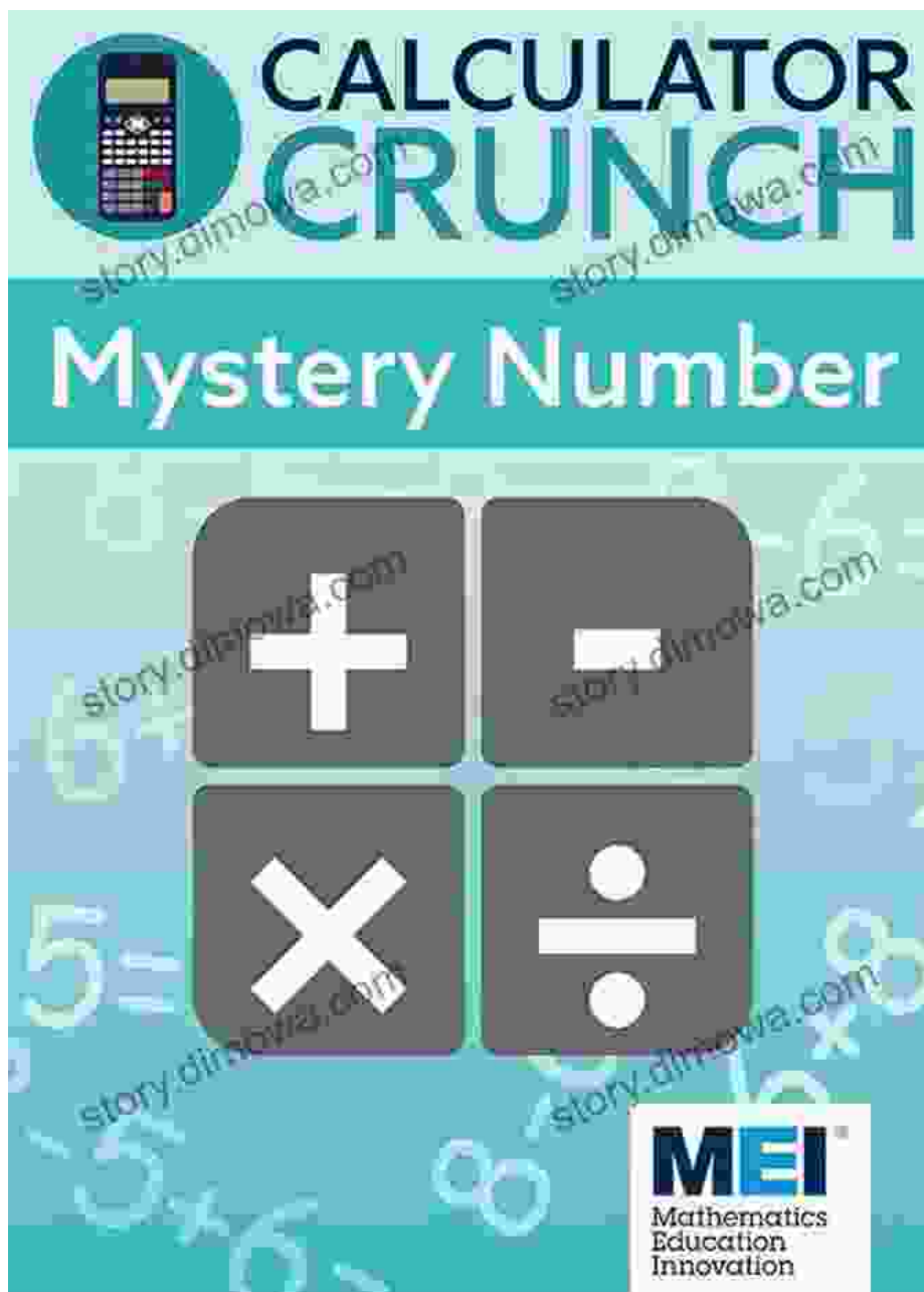
Image of Get Calculating Mystery Number Mei