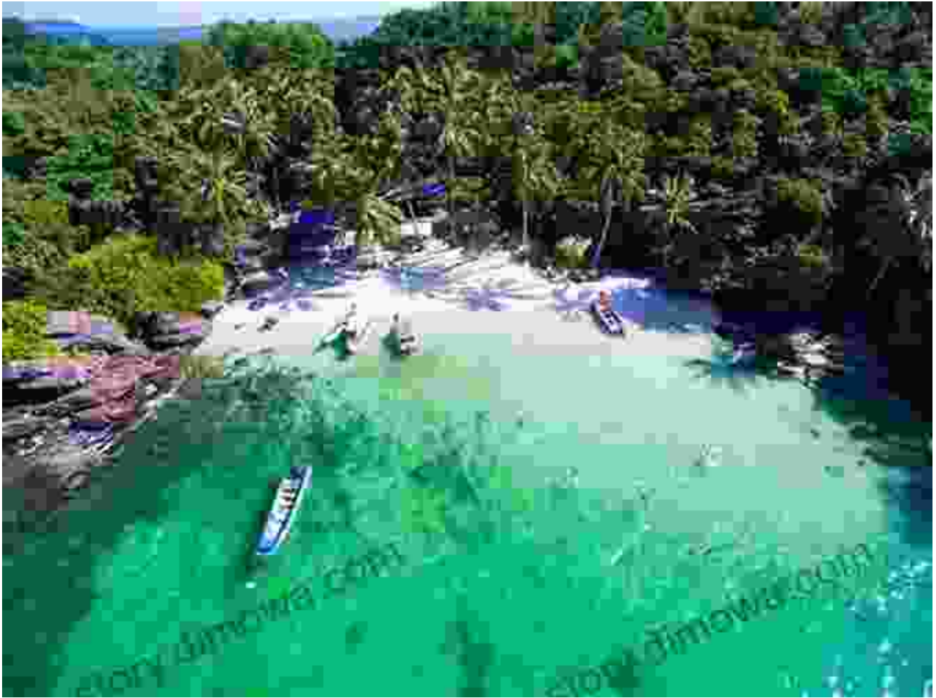
Phu Quoc Island