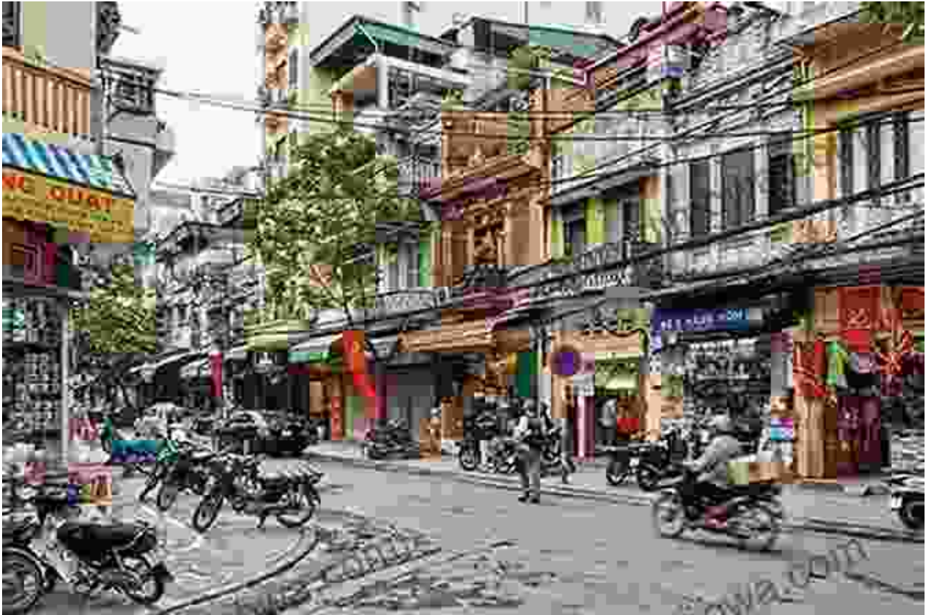
Hanoi's Old Quarter