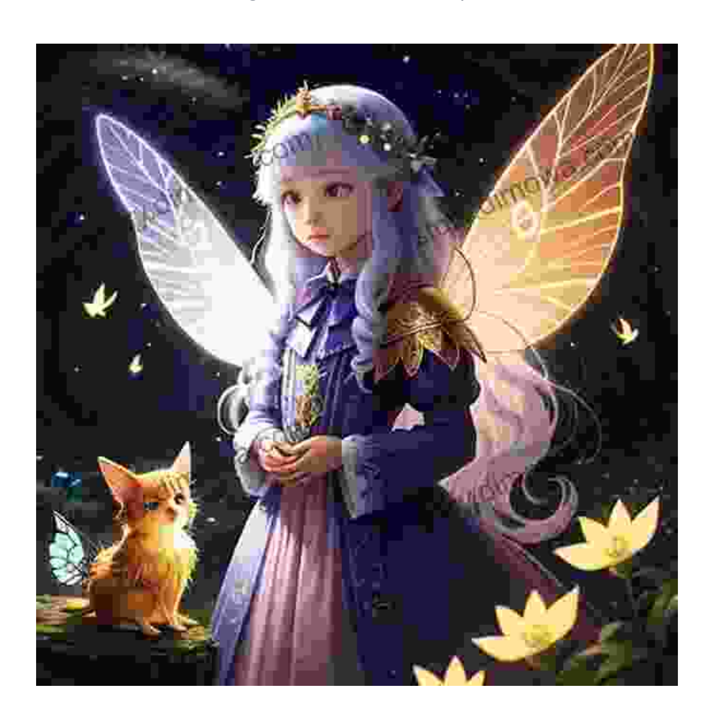
Imagination as a Force for Good

As Luna steps through the Firefly Gate, she finds herself in a vibrant and whimsical world like no other. Here, the trees dance to the tune of the wind, animals talk, and the air is imbued with the scent of adventure. Guided by the wise and enigmatic Firefly Queen, Luna embarks on a quest to discover the true nature of her imagination and the hidden powers that lie within.